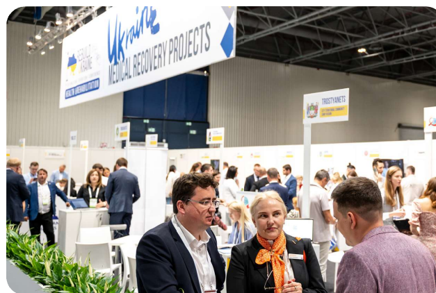
Direct pitching to donors