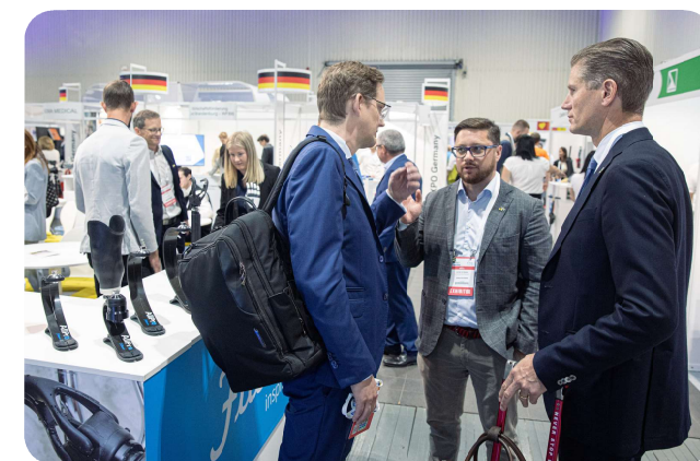
Discussions on grants and funding for 2026